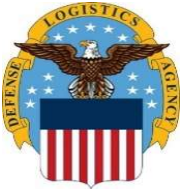
Defense Logistics Agency