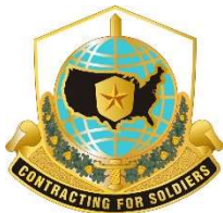
U.S. Army Mission & Installation Contracting Command